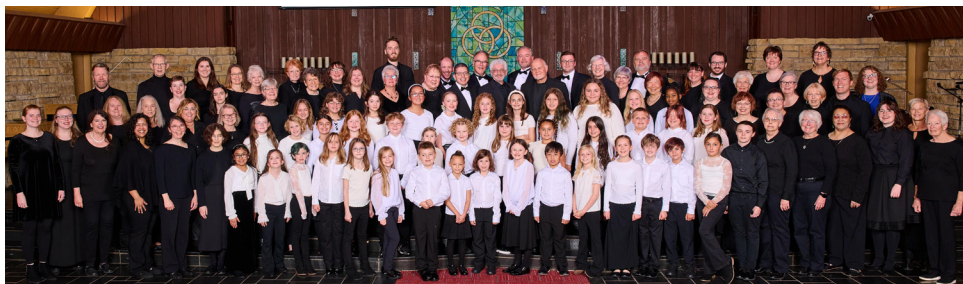
Dubuque Chorale combined choirs, fall 2024